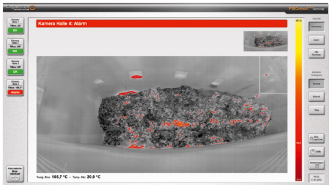
IR panorama image of a waste bunker and touch-screen operating panel