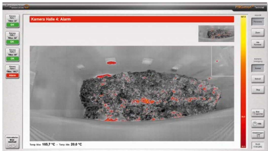
IR panorama image of a waste bunker and touch-screen operating panel